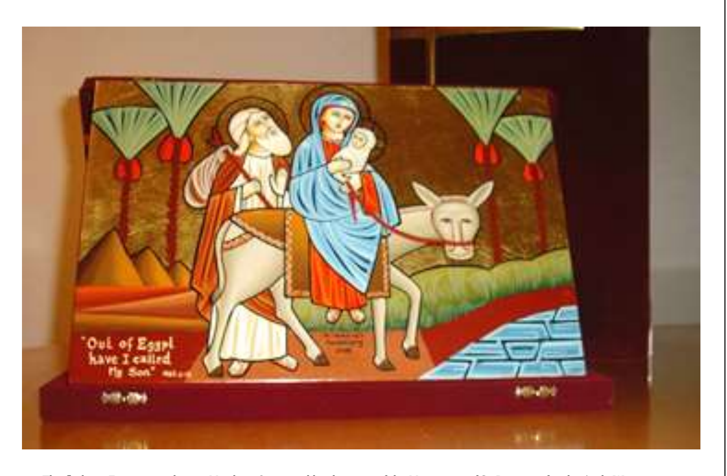
The flight to Egypt according to Matthew 2, painted by the nuns of the Monastery of St. Dimyana for the Arab-West Foundation in The Netherlands ( 19 \text{ cm} \times 29.5 \text{ cm} , packed in a red-purple gift box).